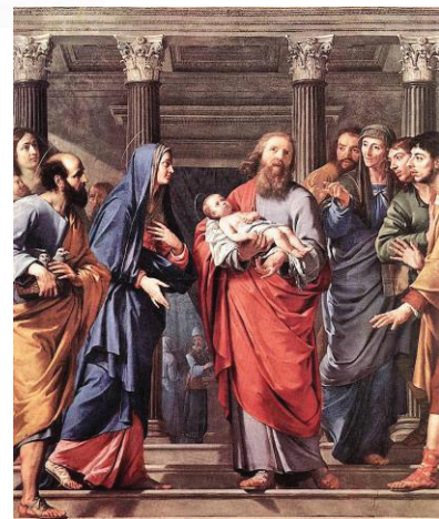
Philippe de Champaigne, Presentation of Jesus French, 1648, Brussels, Musées Royaux des Beaux-Arts